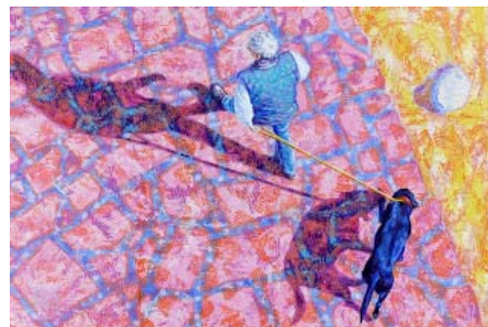
Parenting , by Sally Davies

https://deadline.com/2019/09/addison-riecke-the-lions-of-little-rock-film-adaptation-first-project-from-addison-reickes-new-production-company-1202744081/